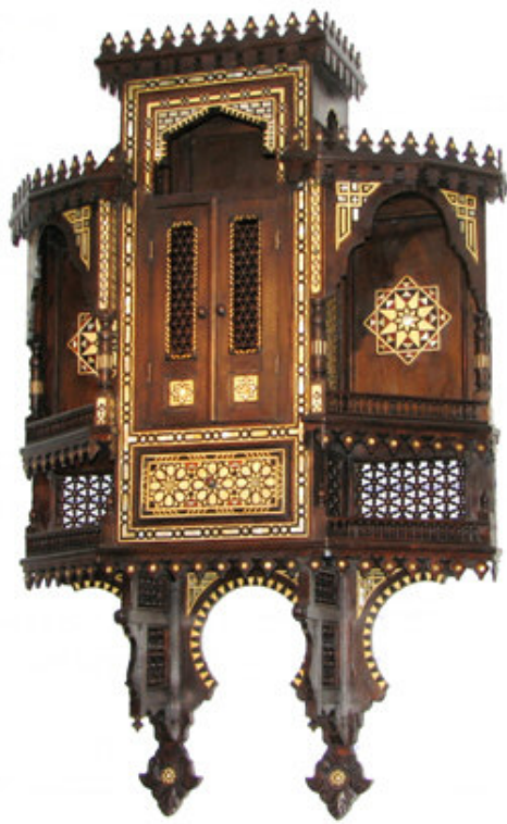
Antique Egyptian Shelf