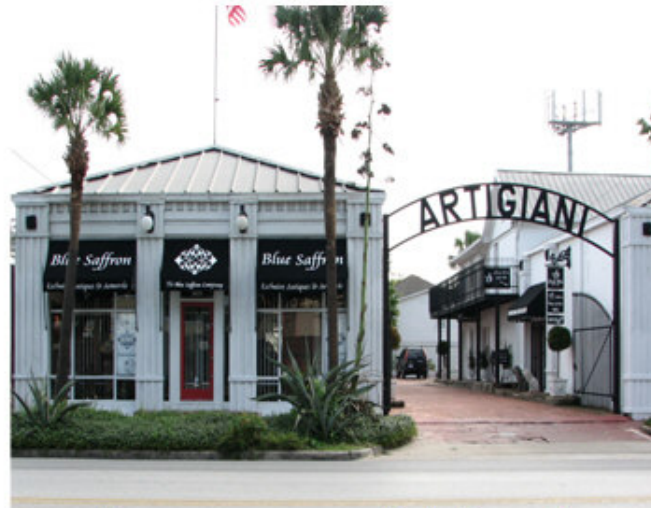
Located at: Artigiani Center - S. Shepherd at Westheimer