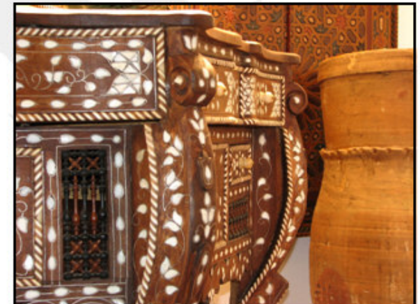
Details of a walnut handcrafted "console" with mother of pearl inserts