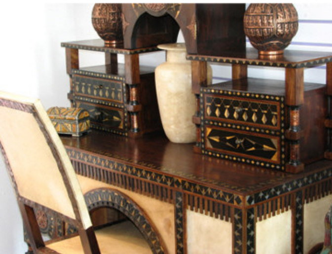
Exclusive Custom Made Bureau-Secretaire