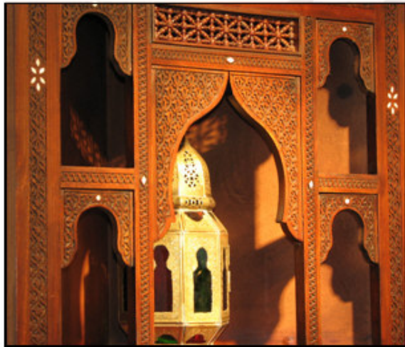
Handcrafted cabinet. Walnut with mother of pearl inserts

At The Blue Saffron Company, we enjoy serving outstanding people who make an effort to distinguish their homes and create their own signature style. We trade in carefully selected exuberant antiques and a stunning range of exotic home furnishings from around the world.