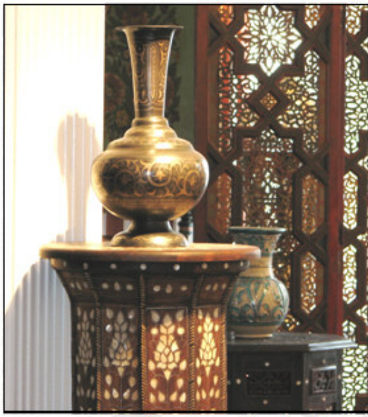
Damascened vase, iron & silver threads

At The Blue Saffron Company, we enjoy serving outstanding people who make an effort to distinguish their homes and create their own signature style. We trade in carefully selected exuberant antiques and a stunning range of exotic home furnishings from around the world.